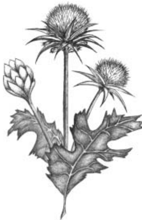
Figure 1. Milk Thistle

The active constituents of milk thistle are flavonolignans including silybin, silydianin, and silychristine, collectively known as silymarin. Silybin (Figure 2) is the component with the greatest degree of biological activity, and milk thistle extracts are usually standardized to contain 70-80 percent silybin. Silymarin is found in the entire plant but is concentrated in the fruit and seeds. Silybum seeds also contain betaine (a proven hepatoprotector) and essential fatty acids, which may contribute to silymarin's anti-inflammatory effect.